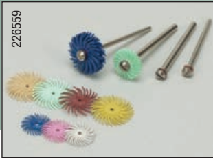
3/4" and 9/16" Radial Bristle Discs

The 9/16-inch and 3/4-inch Scotch-Brite™ Radial Bristle Discs have very flexible bristles for deburring, cleaning, finishing, and polishing detailed parts or tiny areas. These discs can replace chemicals and compounds. The 1-inch disc cleans small areas with heavy duty requirements.