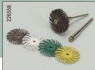
1" Radial Bristle Disc