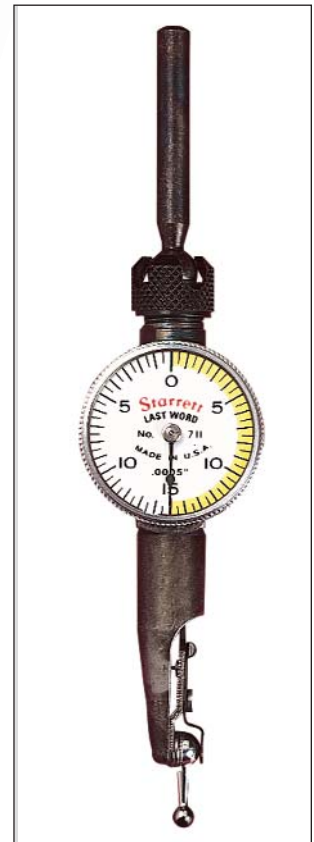
Left: No. 711FSAZ Indicator with universal shank and body clamp attachment.