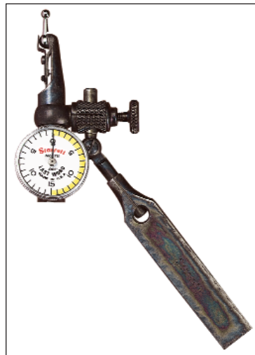
Right: No. 711LPSZ Indicator with Universal Friction Holder and shank.